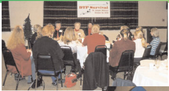
All of the roundtable discussions were popular!